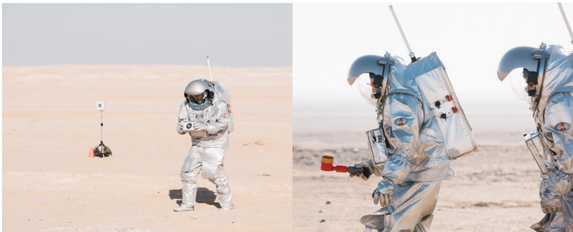
Figure 1 Junior researcher experiments during AMADEE-18: left: radio navigation system for planets without GPS; right: analog astronauts use 3D printed tools for geological sampling tasks.