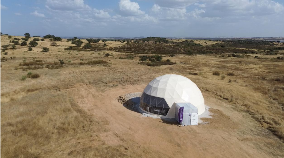
Impressions from the Monsaraz habitat as used during the WBA mission in 2025.