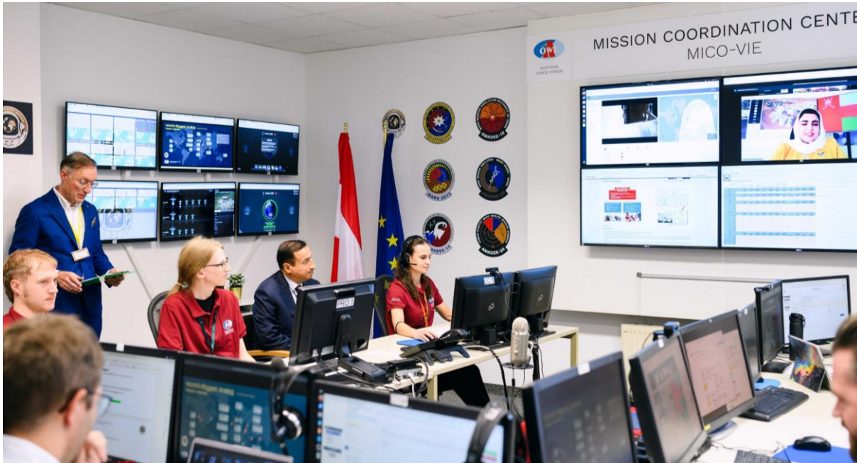
Impressions from the Mission Support Center in Vienna/Austria, during the Worlds Biggest Analog (WBA) 16-habitat mission in October 2025. For AMADEE-27, a basic MSC infrastructure will be available either in Portugal or Austria (tbd).

The A-27 mission comprises the “ground segment”, a Mission Support Center, operated by flight controllers, healthcare professionals, engineers and a ground support team, as well as the “space segment”, operated by a six-person “flight crew”. The flight crew is supported by the “Ground Operations and Support Team” (GOST), responsible for safety and security, as well as technical/logistical support.